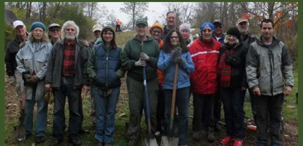
MGSC planting group from October 2017