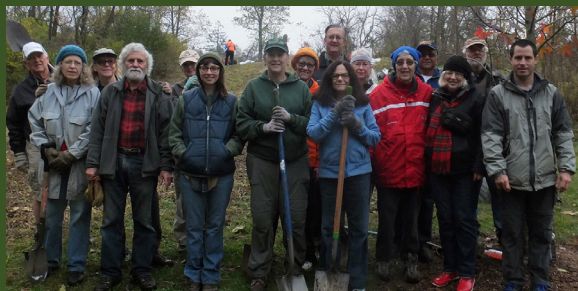
MGSC planting group from October 2017

In honor and memory of NAME Name of tree Miami Group Sierra Club planted YEAR